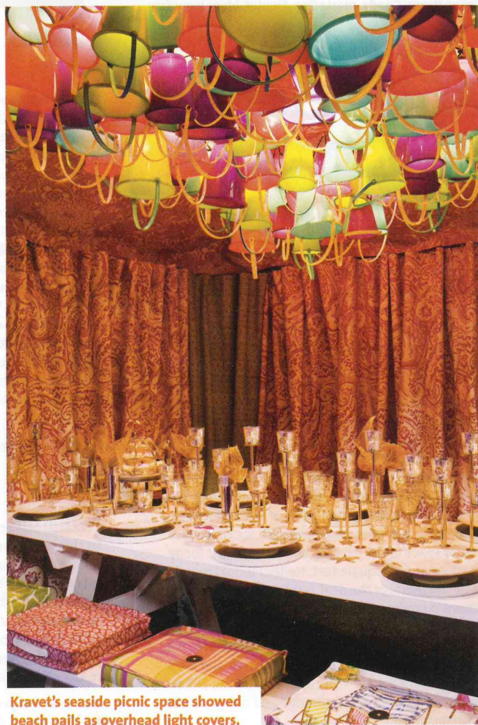
Kravit's seaside picnic space showed beach pails as overhead light covers.