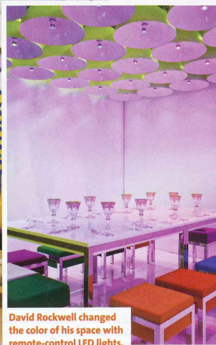
David Rockwell changed the color of his space with remote-control LED lights.